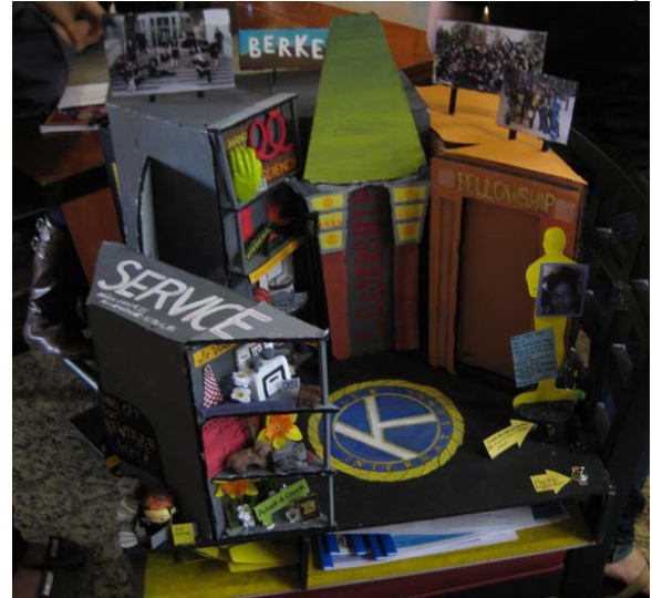
(Above) UC Berkeley's 2009-2010 Scrapbook.

(Left) UCSD's 2010-2011 Scrapbook workday. Our theme was Wizard of Oz so we made Dorothy's house, golden road, and rainbow.